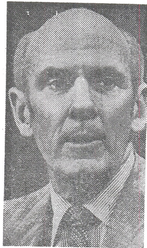
ALAN CRANSTON 'I think it unfortunate'

as a private citizen is the equal justice of the President's decision — that other Watergate defendants are going to trial or to prison while Mr. Nixon goes free."