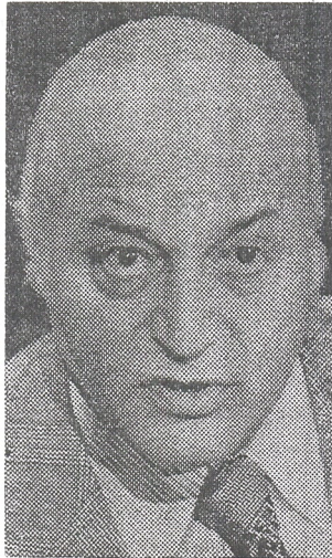
JOSEPH ALIOTO 'I support him'