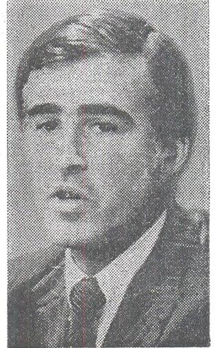
EDMUND BROWN JR. 'Ford was wrong'