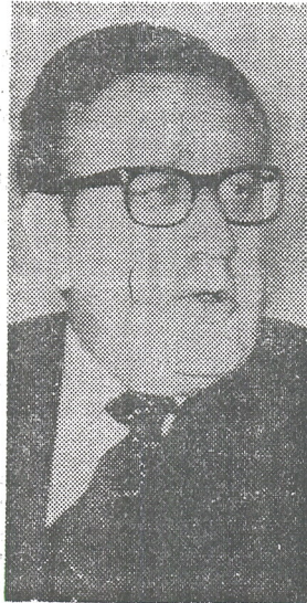
HENRY KISSINGER Rated tops

"I know it might be a deterrent against future actions and I know people talk about his underlings being punished and not him; but from a philosophical sense, I think it is important that the distinction be made between