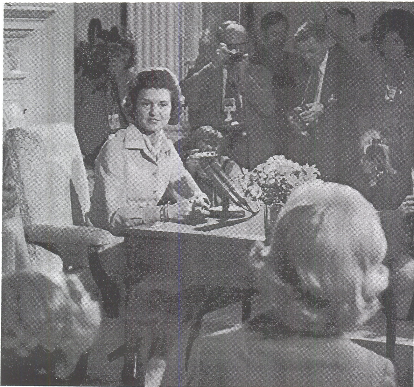
FIRST LADY MEETS THE PRESS