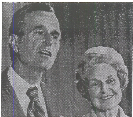
BUSH &amp; SMITH