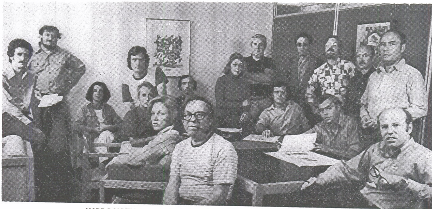
IMPROMPTU SUNDAY CREW IN NEW YORK