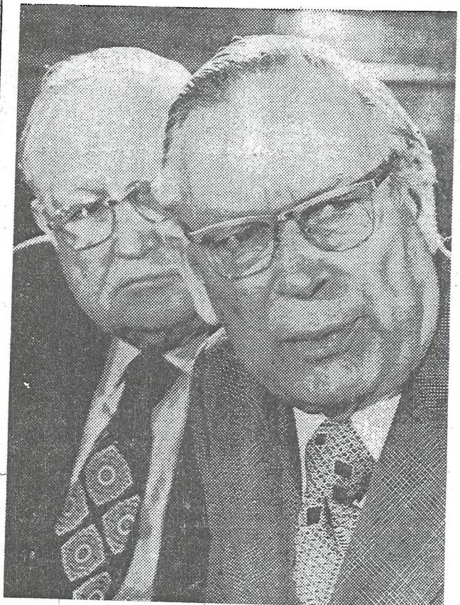
James O. Eastland, left, chairman of the Senate Judiciary Committee, and Roman L. Hruska, ranking Republican member, after yesterday's committee meeting.

"The President's belated action" to comply with the court decisions on the tapes issue, the statement said, "removes only one of the grounds on which we sought impeachment, and it occurred only after the even graver attempt to obstruct justice by abolishing the office of the special prosecutor was carried out."