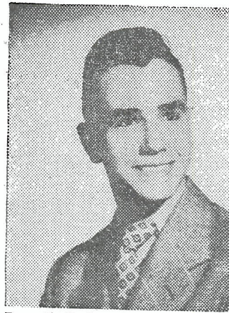
G. Gordon Liddy's biography in the 1948 yearbook of St. Benedict's Preparatory School in Newark. He then entered Fordham and moved from West Caldwell, N.J., to the Bronx.

Wrestling 3; Outdoor Track 3; Cross Country 4; Intramural Track 3.