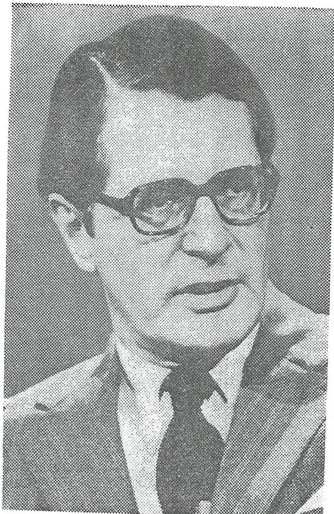
Elliot L. Richardson, the United States Attorney General.