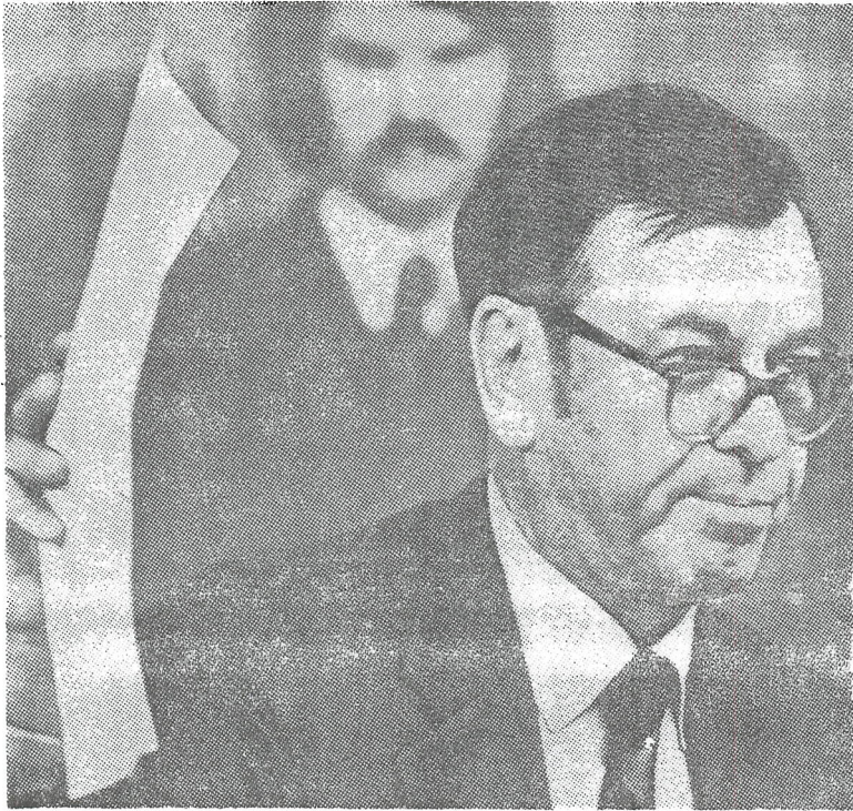
Senator Herman Talmadge is amazed by the subway kisses he's been getting since the hearings began