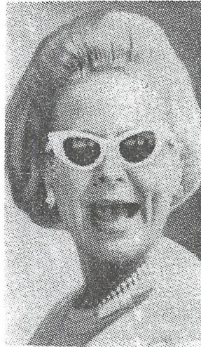
MARTHA MITCHELL 'She blew up'