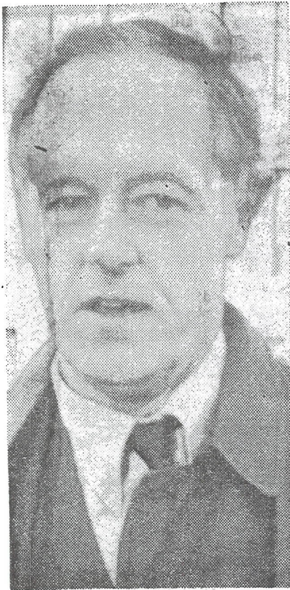
E. HOWARD HUNT JR. ...pleads in court for mercy

"I lost my employment, then my beloved wife (who died in an airplane crash), both in consequence of my involvement in the Watergate affair," Hunt told Sirica. "Humbly, with profound contrition, I ask now that your honor look beyond the Howard Hunt of last June 17 to my life as a whole. And if it please this court, to temper justice with mercy."