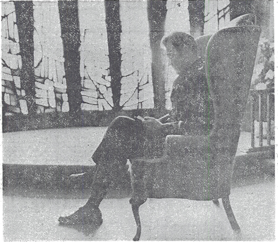
An Army officer spends a few moments in the Meditation Room at the Pentagon—one of several areas set aside for prayer

"Thursday is the best day of the week," said Senator Jennings Ran-