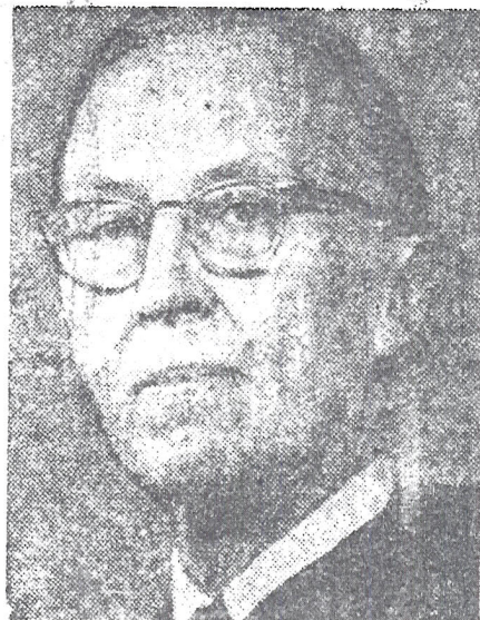
JUSTICE LEWIS F. POWELL JR.

We are going to change the way we are going to do this and rather than government doing more for people and making people more dependent upon it, what I am standing for is government finding ways through the government programs to allow people to do more for themselves, to encourage them to do more for themselves; not only encourage them, but to give them incentive to do more for themselves on their own without government assistance.