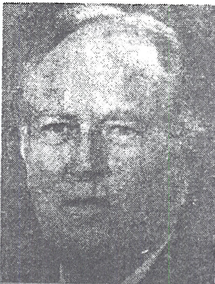
SECRETARY OF STATE ROGERS

Now, having said that, I do not mean that we turn to reaction. I do not mean