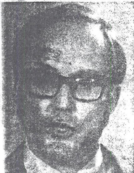
JUSTICE WILLIAM H. REHNQUIST

next year, we are going to have an open administration, contact with the press, and so forth, but only when it serves the public interest. Whenever I find that we