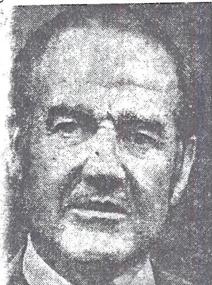
SEN. GEORGE MCGOVERN

at campaigns now bore the people to death, because they are simply too long and they see them on the tube a lot. Then you can read about it in the newspaper and put it aside, but when the evening news comes on, month after month — it isn't just two months of the regular campaigns; you hear of the convention, you hear it between the conventions, but then the campaign begins two years before when they start speculating about who is going to run in the primaries and when the polls are taken. Then you have the primary campaigns.