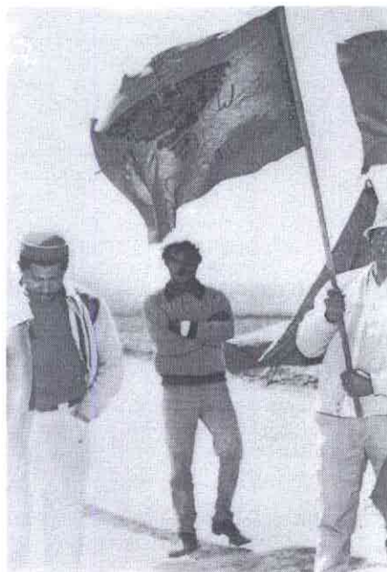
UNITED FARM WORKERS STRIKING AGAINST LETTUCE. Too humble a household staple to become

The idea was to spark a boycott of iceberg lettuce—the kind that looks like a head of cabbage—in support of Cesar Chavez's two-year-old strike against growers in California. Chavez, grateful for the Democratic boost, believes that the boycott is beginning to take hold and in fact is doing as well as the grape boycott did at a comparable time in its history. But the evidence is not so reassuring. For a while after the conven-