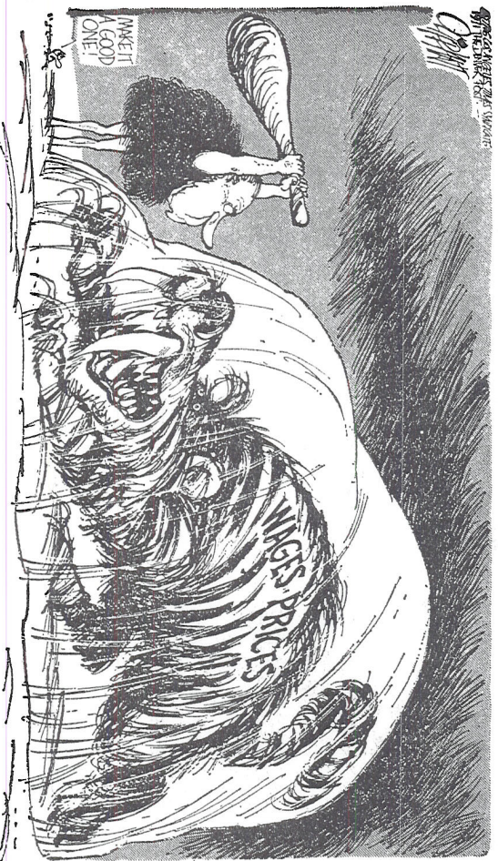
COMES THE THAW . . .

Reprinted from "The Third Year of the Nixon Watch"