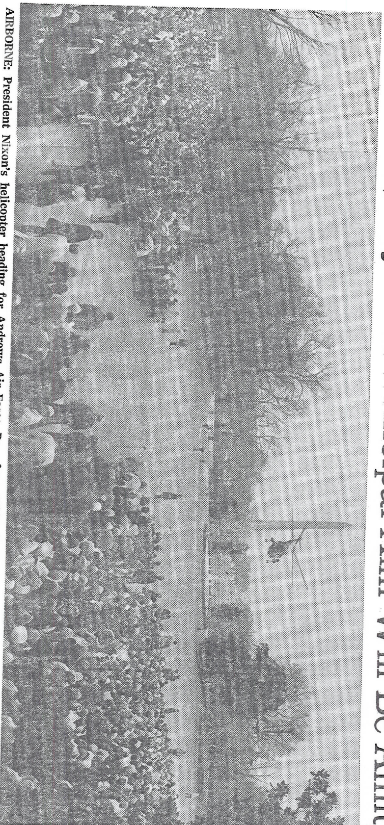
AIRBORNE: President Nixon's helicopter heading for Andrews Air Force Base from White House lawn. Invited guests gathered for the event.