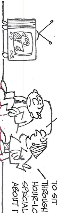
Washington Star Syndicate, Inc.