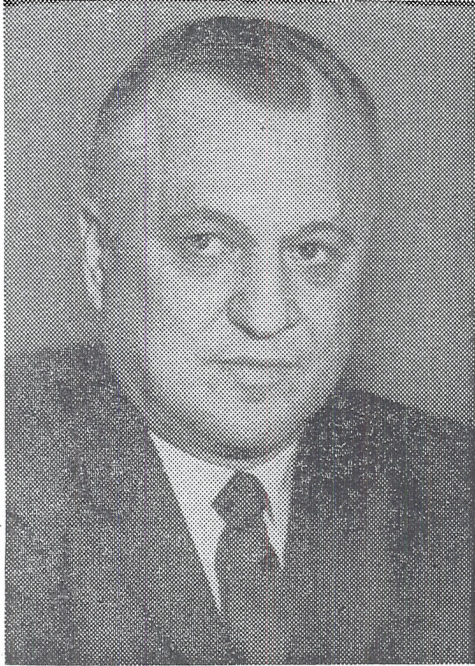
Walter J. Hickel