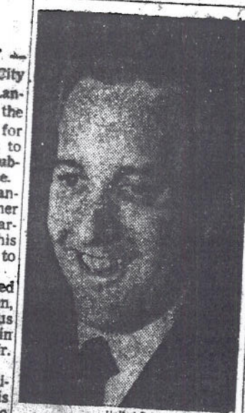
Moon Landrieu

He has never been known as anything but a liberal or a moderate since he has been in politics. His reputation was created in 1962 during the New Orleans school desegregation crisis, when he emerged as the only member of the Louisiana legislature to stand up day after day against Gov. Jimmie Davis's attempt to take over the public schools here.