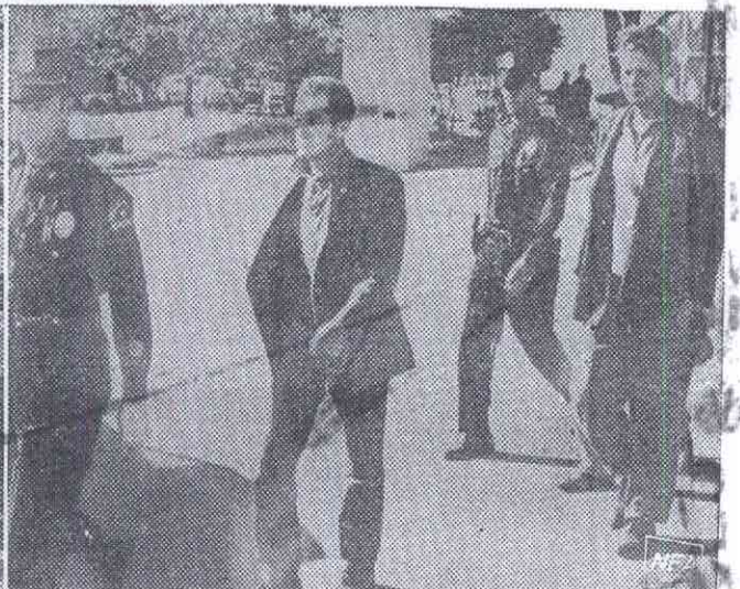
THESE PICTURES allegedly show suspects being arrested shortly after Kennedy's assassination. Garrison says these men were accomplices.