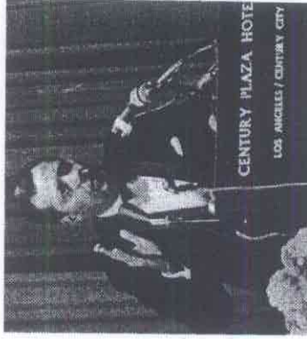
CENTURY PLAZA HOTEL LOS ANGELES / CENTURY CITY

OF NEW ORLEANS' DISTRICT ATTORNEY'S L.A. SPEECH CRITICIZING JOHNSON ON KENNEDY ASSASSINATION