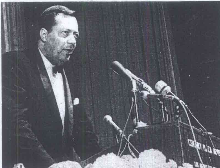
New Orleans' District Attorney Jim Garrison spoke Tuesday night at Century Plaza Hotel about his Kennedy Assassination probe.

government did in the Kennedy assassination, and it was a well-planned assassination, involving a number of individuals as you will learn, I assure you. What the government did, was to practice two essential actions to conceal the truth of the assassination.