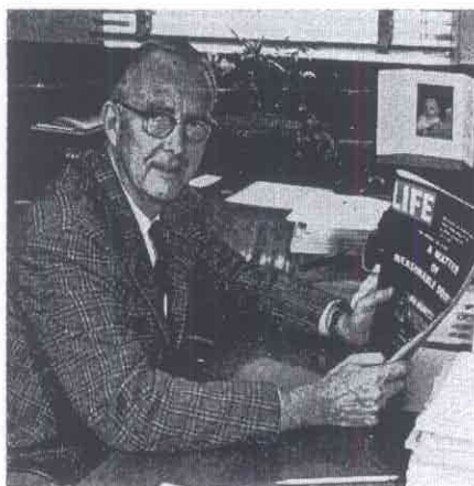
MUCH-THUMBED COPY of "Life" magazine may still hold new clues to the assassination mystery, believes LRL physicist Luis Alvarez (above).

The essence of Alvarez' contribution is the discovery that the Abraham Zapruder motion-picture films of the assassination, printed in Life and in the Warren Report, contain internal clues