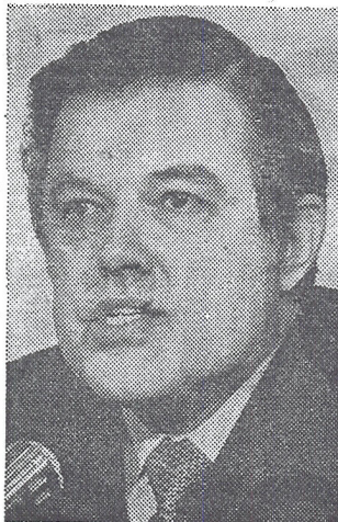
SEN. FRANK CHURCH ... will air charges