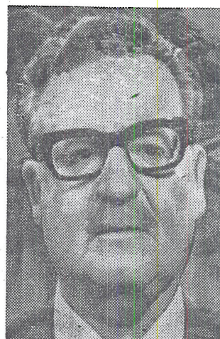
SALVADOR ALLENDE ... target of efforts