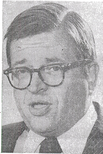
CHARLES W. COLSON