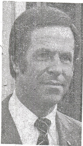
H.R. (BOB) HALDEMAN ... cheerful at proceeding

a flurry of unresolved questions, including the key issue of whether former President Nixon, still confined in a California hospital for treatment of phlebitis, will be required to testify.