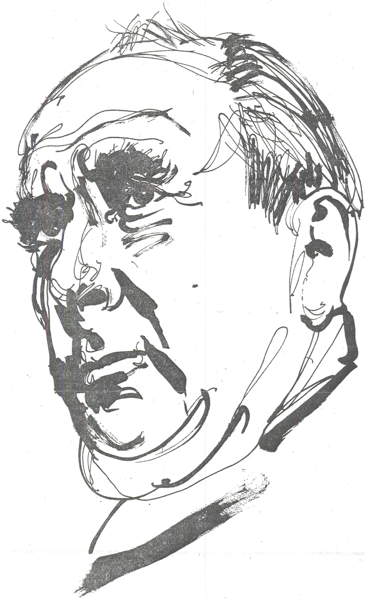
John N. Mitchell, the former Attorney General