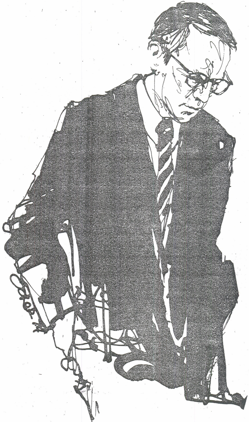
John W. Dean III, counsel to the President