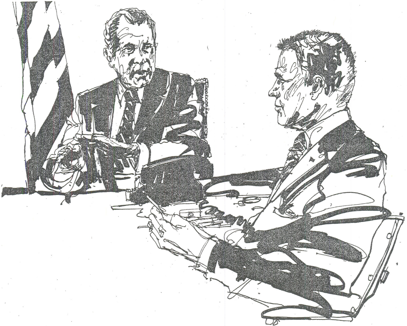
President Nixon and H. R. (Bob) Haldeman in the Oval Office

regard to what we call the electronic stuff they heard, and what I have now found is in the leak area of the national security area. That I consider privileged.