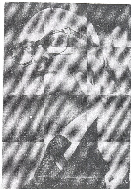
Associated Press and United Press International