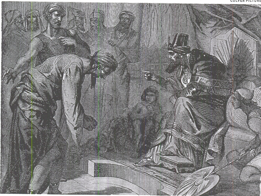
THE ANGRY MASTER REBUKING THE UNMERCIFUL SERVANT