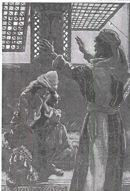
NATHAN REPROACHING KING DAVID

Richard Nixon, on the other hand, has so far scorned even the language of contrition. He referred only to deep "regret and pain" over the Watergate "mistakes" and "misjudgments." His behavior even comes perilously close to that in Jesus' famous parable of the unmerciful servant: a man had been forgiven a large debt by his master, then brutally tried to collect what was owed him by a subordinate. After his own pardon, Nixon fervently opposes amnesty for Viet Nam War resisters. Indeed, according to his son-in-law David Eisenhower, Nixon now says that he would