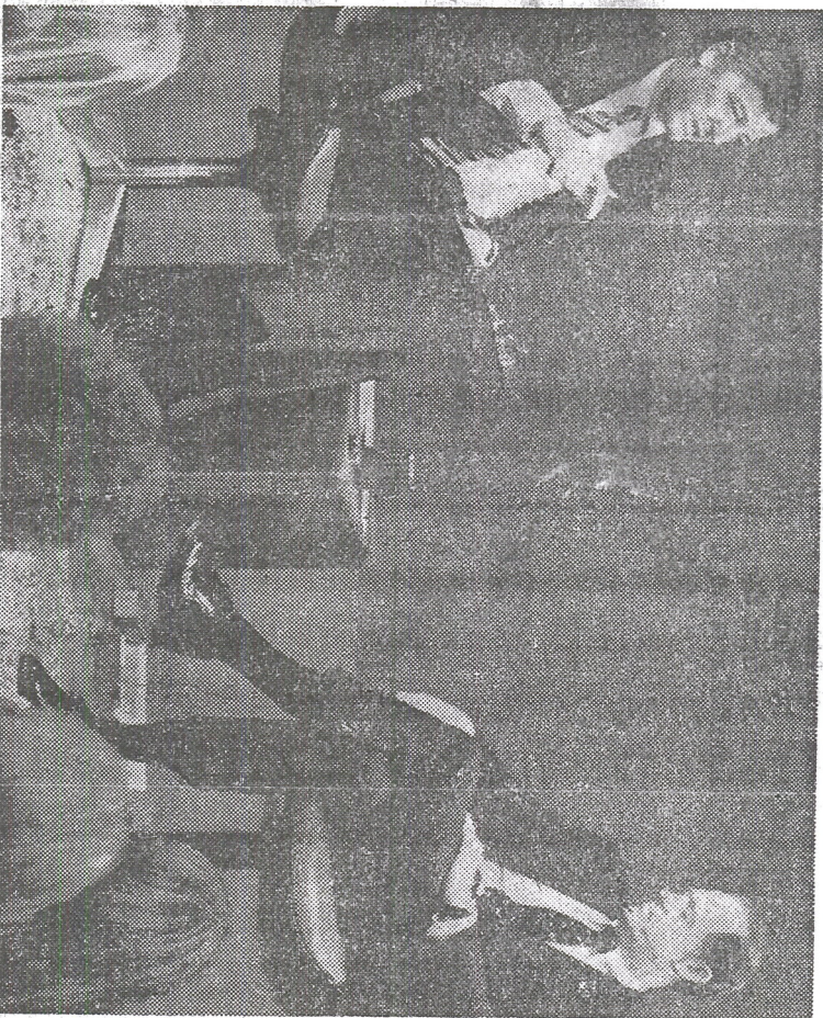
Hunt (r) on Buckley's 'Firing Line' in January, 1973. Watergate: The spirit of CIA.