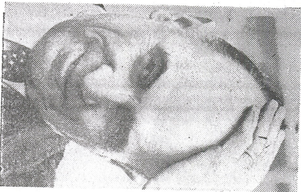
McCord: Hunt knew . . .