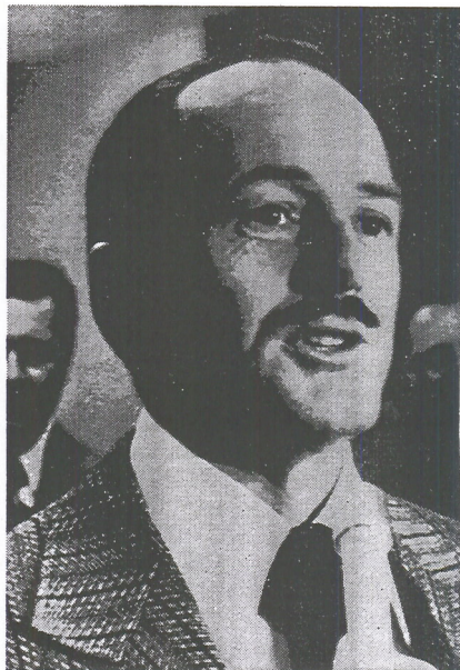
AMERICAN PARTY NOMINEE JOHN SCHMITZ