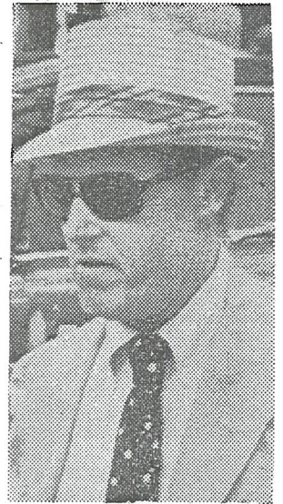
The New York Times