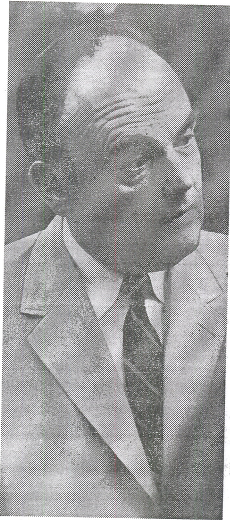
Ohio, airport, center; presiden-