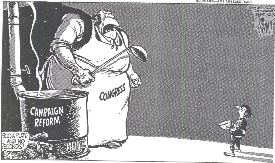
"More?? You want more?!"