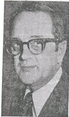
FRED J. BUZHARDT ... "my hands tied."

The draft report, part of which is typed and a larger part of which is in Dean's