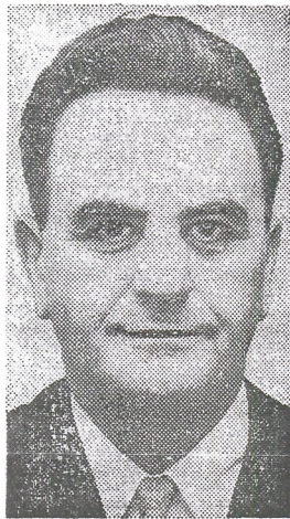
JUDGE JOHN J. SIRICA clarifies intention

"If I interpret Judge Sirica's order correctly," Patman said, "this legal question has been cleared up in favor of the Congress and the Banking and Currency Committee proceeding."