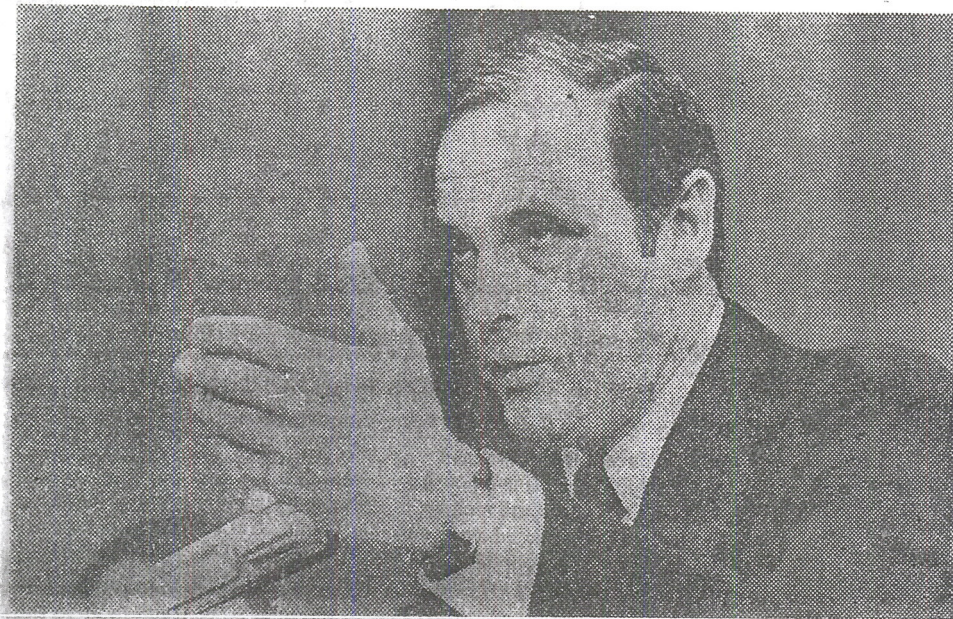
Alexander P. Butterfield, former White House aide, told of taping conversations

The recordings became the immediate focus of the central investigation by the Senate panel into the role President