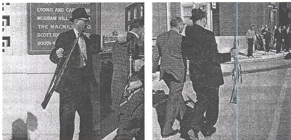
Exhibit No. 15

The crime scene search detail continued to process the evidence in the building amid the continued search for the suspect. The book cartons in the area where the rifle was found as well as the cartons which made up