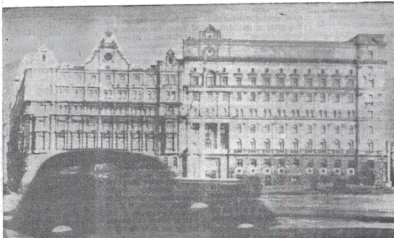
KGB headquarters on Moscow's Dzerzhinsky Square also houses Lubyanka Prison. Cheka occupied it in 1918.