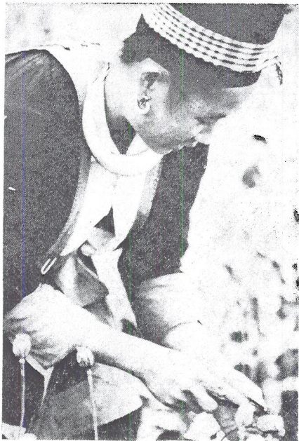
Harvesting opium in Phou Wei Village, northeastern Laos