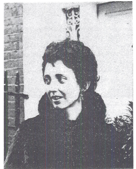
Joyce Carol Oates

It was as a writer of stories that she began her career in the early 1960s, and she has continued to write stories ever since, not as a diversion or spin-off from the writing of novels, but as a central concern in her work—a fortunate recognition that the shorter form is peculiarly suited to her. There is a sense of tension, of nerves stretched to the breaking point, of "the pitch that is close to madness" in much of