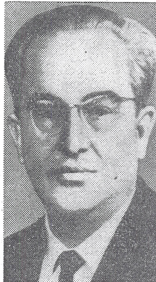
Yuri V. Andropov

The agency prints its own house organ, called Chekistsky Sbornik. The magazine has a select and limited circulation.