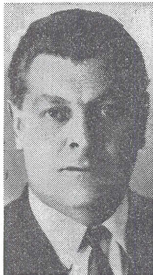
Anatoly I. Lazarev

The organization has its own museum in Moscow, displaying mementoes of past security exploits. The exhibits include the parachute used by the American U-2 pilot, Francis Gary Powers, shot down over the Soviet Union in 1960. The museum is not open to the public.