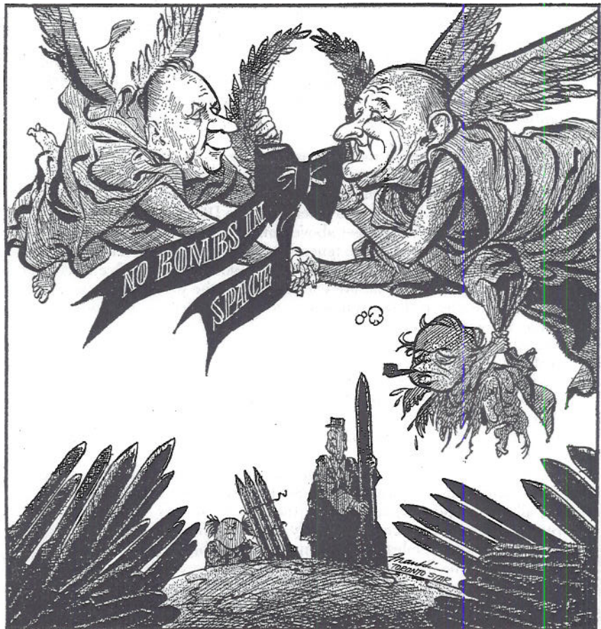
—Toronto Daily Star.

Needless to say, the question must be asked: What kind of danger might threaten whom from an installation whose sole purpose is to prevent enemy rockets with nuclear warheads from hit-