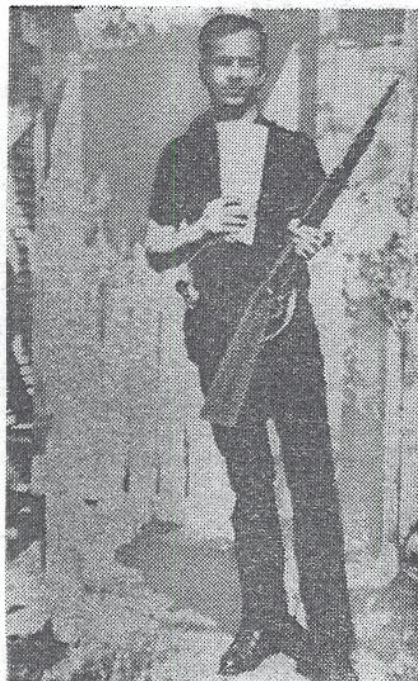
OSWALD OR A PASTEUR?

Below is shown a picture of "the home of General Walker", reputedly found among Oswald's belongings. Sometime after the picture was taken, but before it was