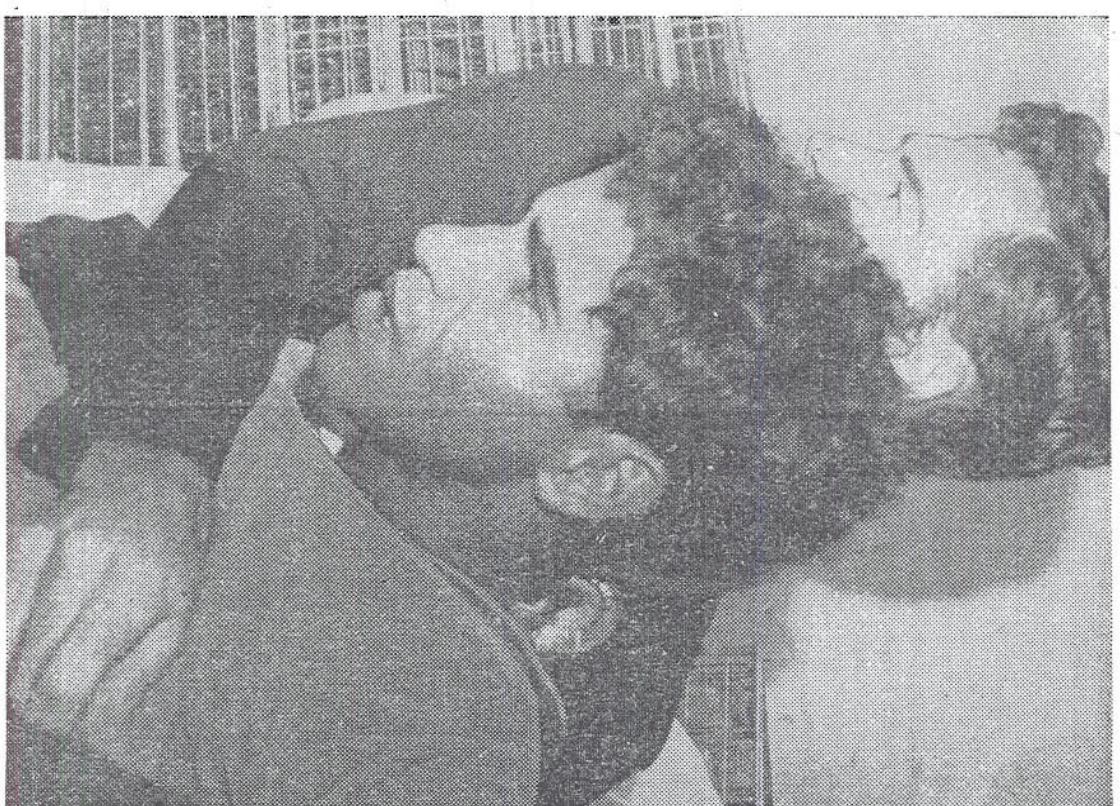
Sirhan Sirhan is taken from Ambassador Hotel in Los Angeles after shooting of Robert Kennedy.

In recent weeks and months, some of the nation's best-known newspapers have published stories examining doubts raised about the assassination. See SIRHAN, Page C5