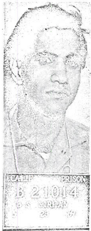
Sirhan Bishara Sirhan after conviction in 1969.