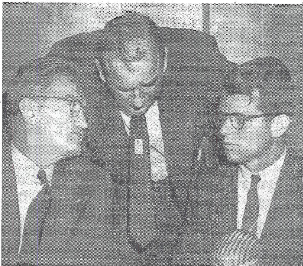
ON THE McCARTHY COMMITTEE: Mr. Kennedy in 1954, when he was serving as an assistant counsel to the Senate Permanent Subcommittee on Investigations, headed by the late Joseph R. McCarthy, center, the controversial Republican Senator of Wisconsin. At left is Senator Stuart Symington, Democrat of Missouri, a member of the committee.