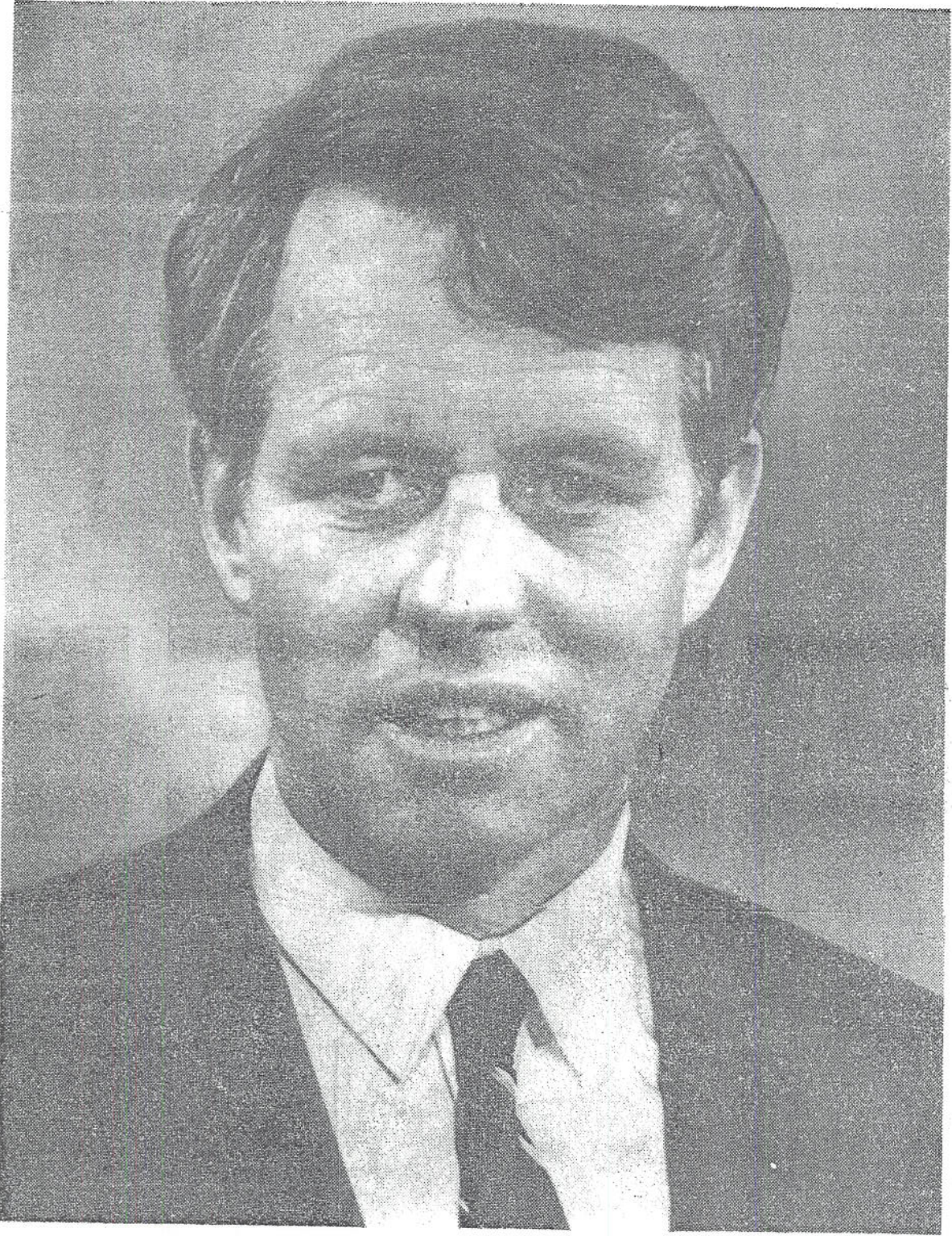
Robert F. Kennedy . . . 1925-1968