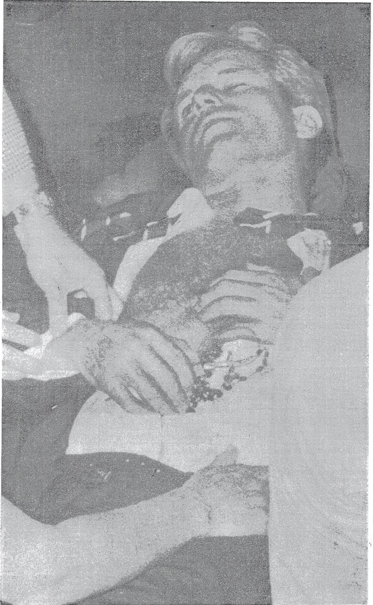
Clutching a rosary given him by a priest, Kennedy lies on floor of the hotel