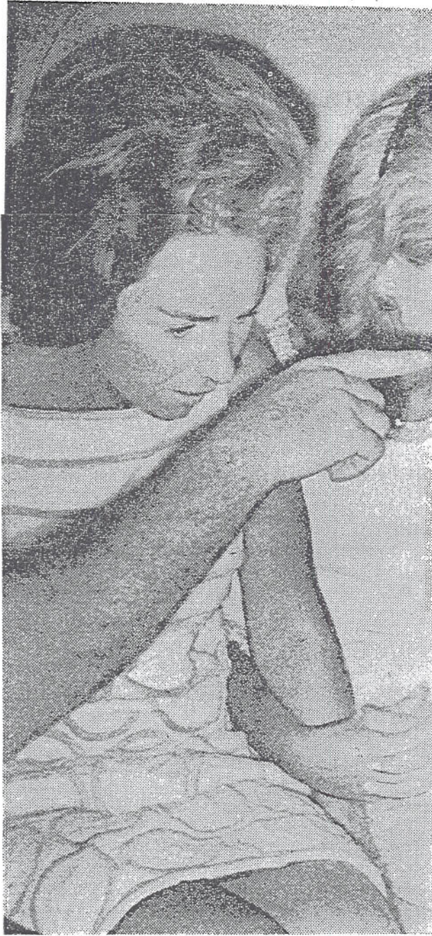
A stunned Ethel Kennedy is shown as she rode in ambulance that carried her husband to the hospital.