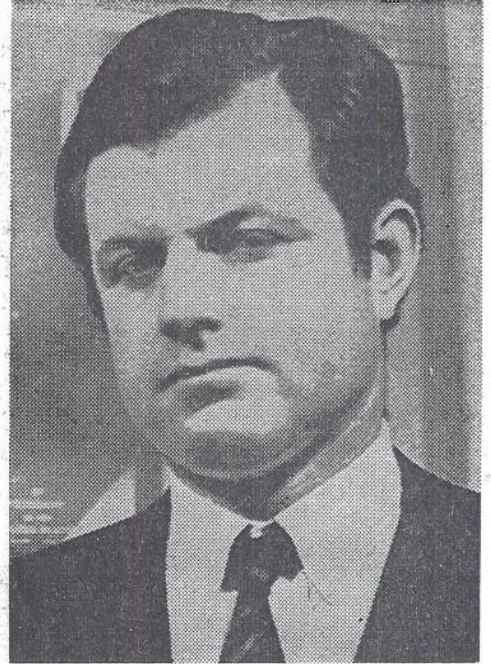
SEN. EDWARD KENNEDY

mandatory in cases where someone leaves the scene of an accident in which there has been a fatality and negligence is proved.