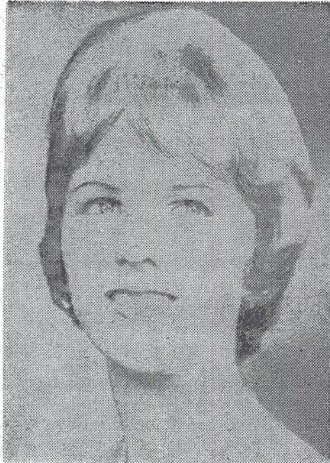
MARY JO KOPECHNE

Under Massachusetts law, a manslaughter charge is