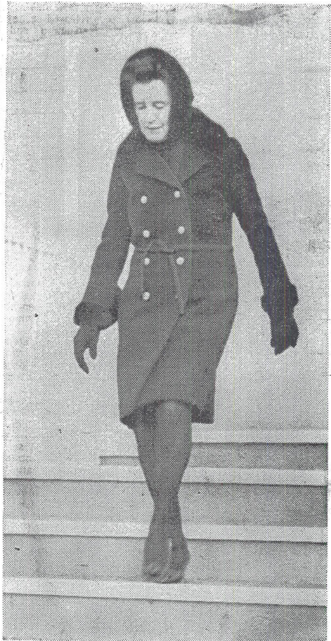
In Hyannis, Mass., Mrs. Joseph P. Kennedy was present at memorial mass for her son at St. Francis Xavier Church.