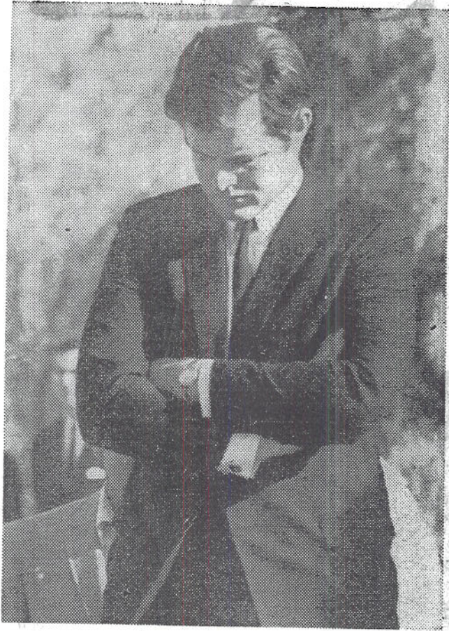
Senator Edward M. Kennedy, Massachusetts Democrat, visited grave of his brother, slain five years ago yesterday.