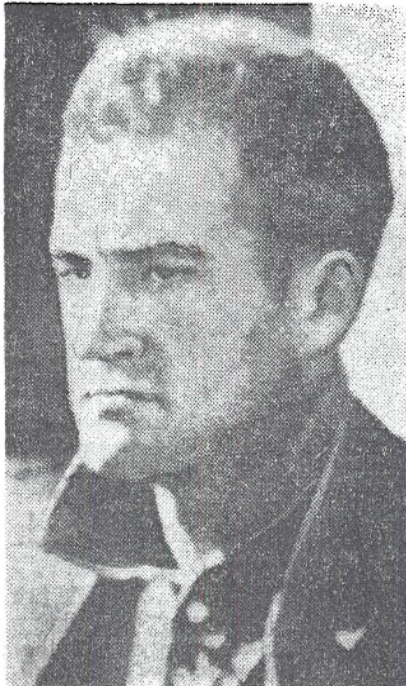
THE DALLAS SUSPECT Ex-FBI agent found the similarities striking