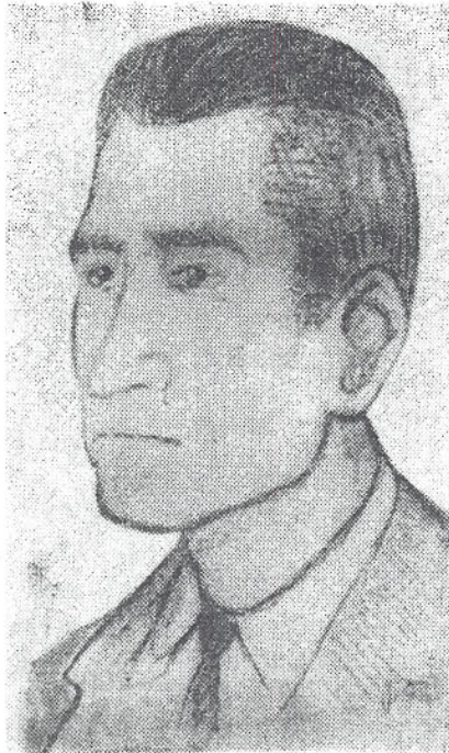
THE MEMPHIS SKETCH